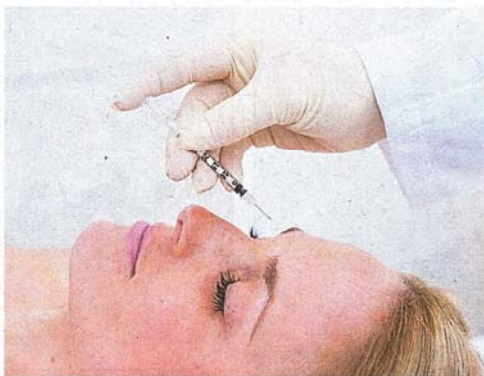
■ Botox treatment being performed at the new Subiaco medi-spa.

cancer sufferers were also benefiting from healthier, smoother skin.